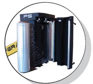
Quick & Easy Film Loading